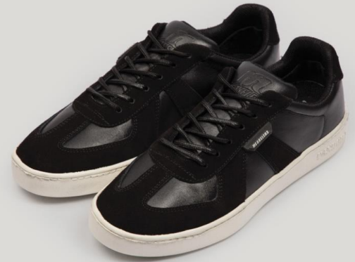
CODE : ME20182 Gender : Natural leather