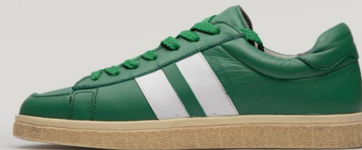
CODE : ME20354 Gender : Natural leather