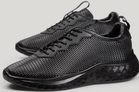
CODE : ME20002 Gender : Natural leather