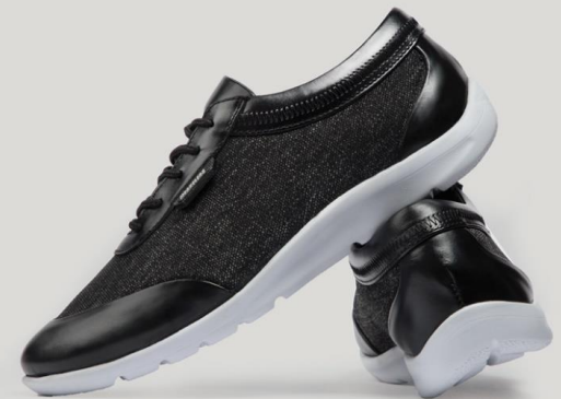
CODE : ME20102 Gender : Spaser & Natural leather