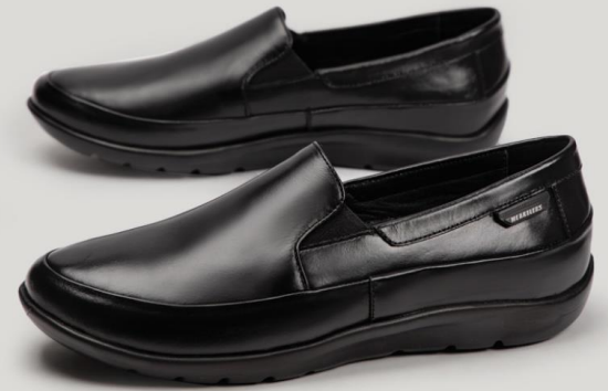
CODE : ME20107 Gender : Natural leather