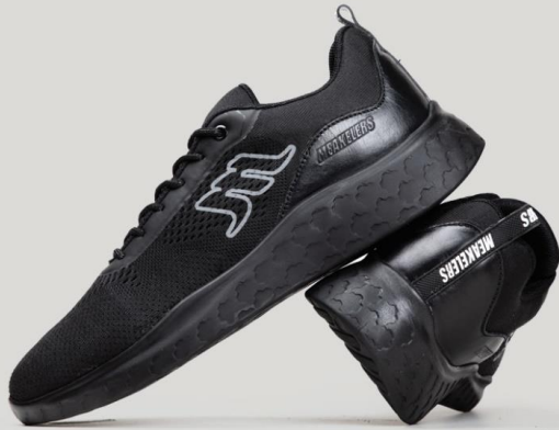
CODE : ME40008 Gender : Spaser&Natural leather