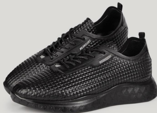
CODE : ME40000 Gender : Natural leather