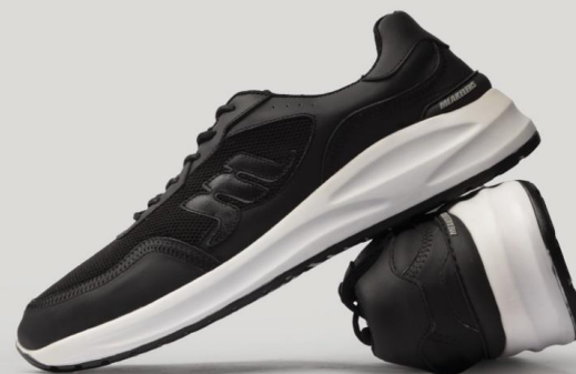
CODE : ME40302 Gender : Spaser & Natural leather