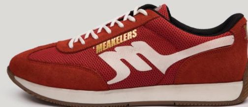
CODE : ME20222 Gender : Spaser & Natural leather