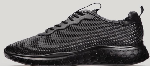
CODE : ME40004 Gender : Natural leather