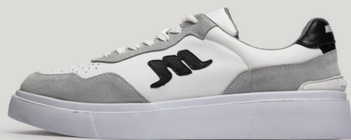
CODE : ME40330 Gender : Natural leather