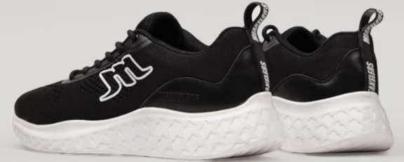
CODE : ME20008 Gender : Spaser & Natural leather