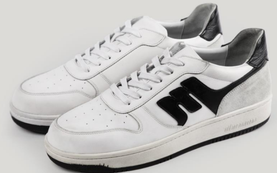
CODE : ME40100 Gender : Natural leather