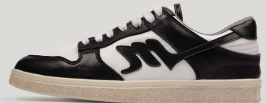
CODE : ME20352 Gender : Natural leather