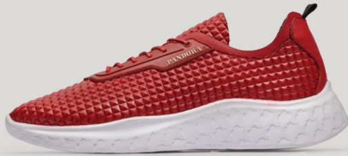
CODE : ME20000 Gender : Natural leather