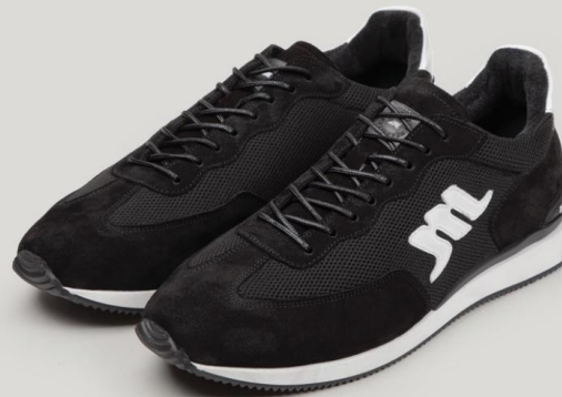
CODE : ME40250 Gender : Natural leather