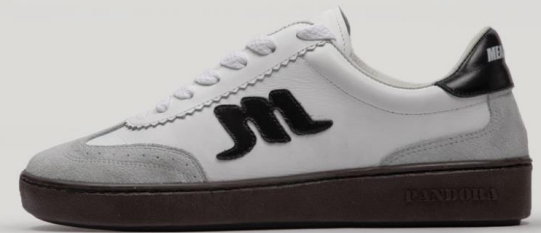
CODE : ME20184 Gender : Natural leather