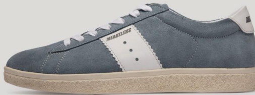
CODE : ME40204 Gender : Natural leather