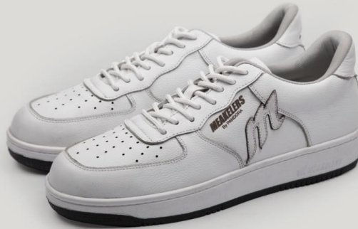
CODE : ME40102 Gender : Natural leather