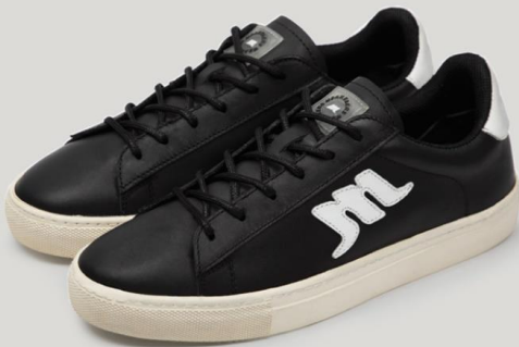
CODE : ME20164 Gender : Natural leather