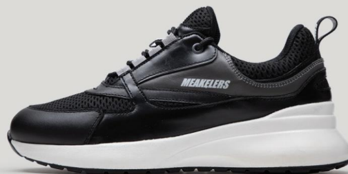
CODE : ME20380 Gender : Spaser & Natural leather