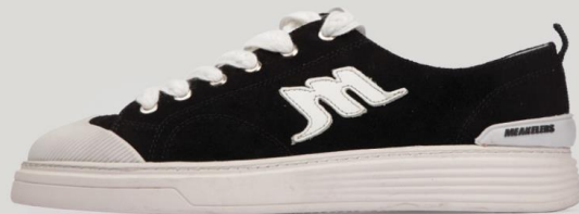
CODE : ME20190 Gender : Natural leather