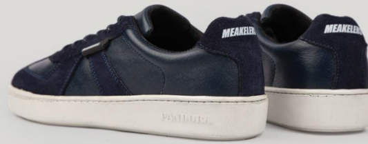
CODE : ME20182 Gender : Natural leather