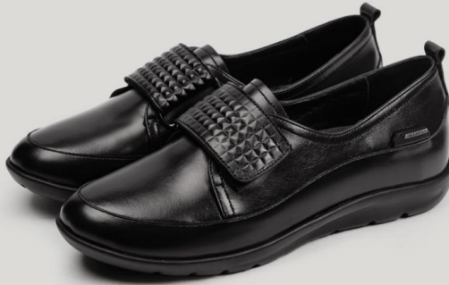
CODE : ME20103 Gender : Natural leather