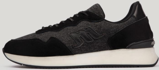
CODE : ME20150 Gender : Spaser & Natural leather