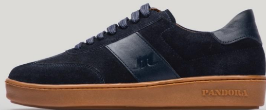
CODE : ME20180 Gender : Natural leather