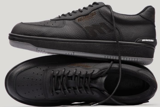
CODE : ME40104 Gender : Natural leather