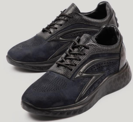
CODE : ME40002 Gender : Natural leather