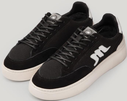
CODE : ME20130 Gender : Spaser & Natural leather