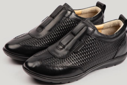
CODE : ME20101 Gender : Natural leather