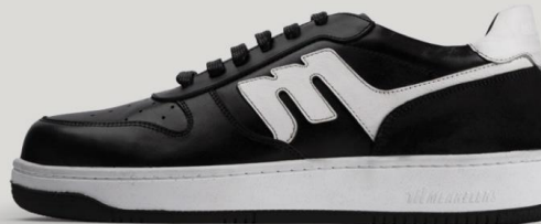
CODE : ME40100 Gender : Natural leather