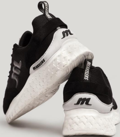
CODE : ME40006 Gender : Spaser&Natural leather