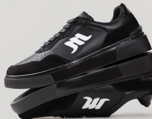
CODE : ME40330 Gender : Natural leather