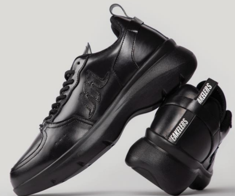
CODE : ME20300 Gender : Natural leather