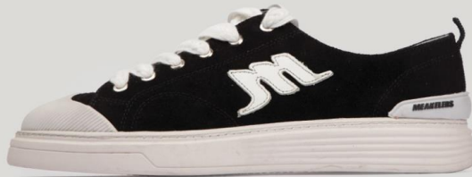
CODE : ME20190 Gender : Natural leather