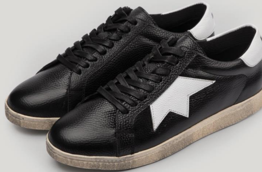
CODE : ME40200 Gender : Natural leather