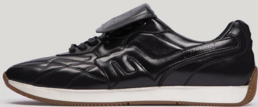
CODE : ME40220 Gender : Natural leather