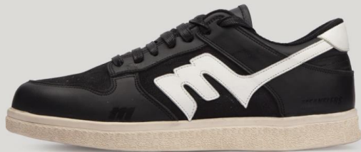
CODE : ME40202 Gender : Natural leather