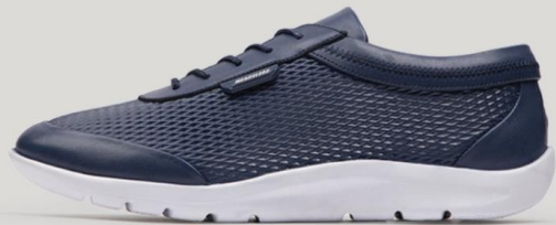
CODE : ME20100 Gender : Natural leather