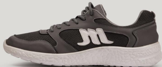
CODE : ME20400 Gender : Spaser & Natural leather