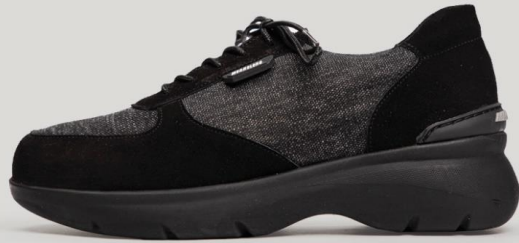
CODE : ME20302 Gender : Spaser & Natural leather