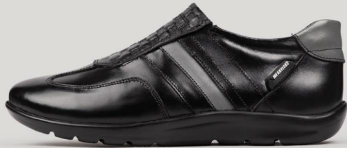
CODE : ME20105 Gender : Natural leather