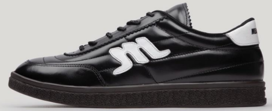
CODE : ME40206 Gender : Natural leather