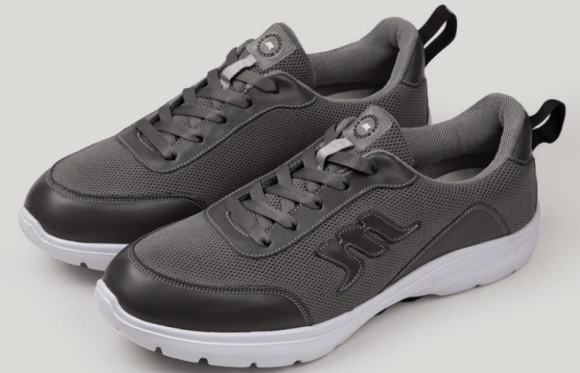
CODE : ME40400 Gender : Spaser & Natural leather