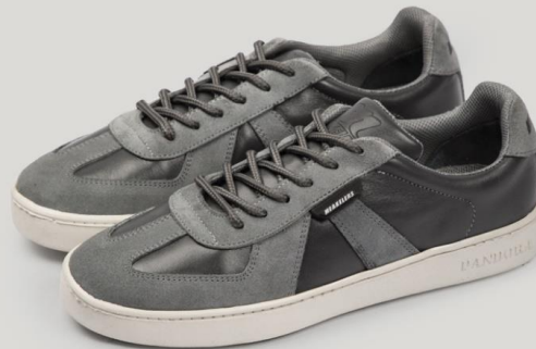
CODE : ME20182 Gender : Natural leather