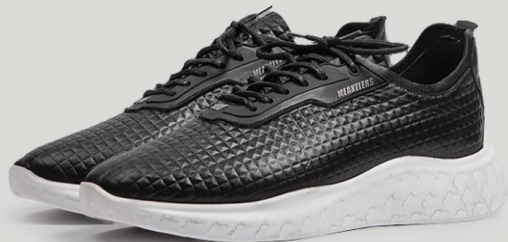
CODE : ME40000 Gender : Natural leather