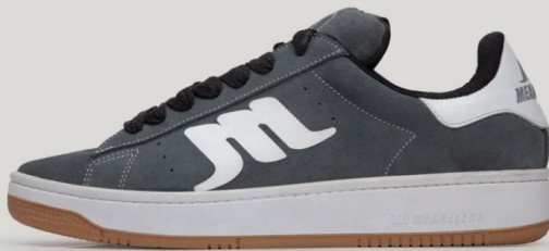
CODE : ME40106 Gender : Natural leather