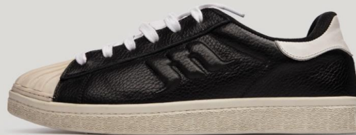
CODE : ME20350 Gender : Natural leather