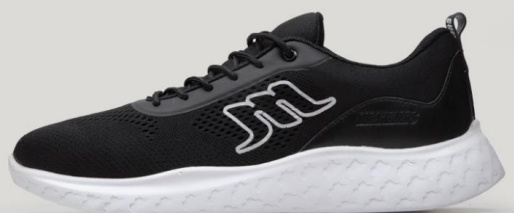
CODE : ME40008 Gender : Spaser&Natural leather