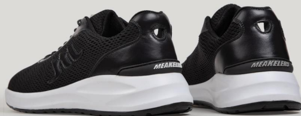
CODE : ME40300 Gender : Spaser & Natural leather