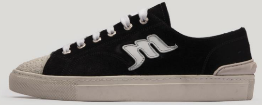
CODE : ME20160 Gender : Natural leather