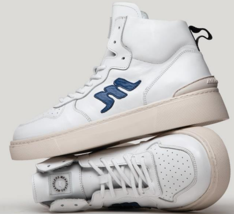
CODE : ME20132 Gender : Natural leather