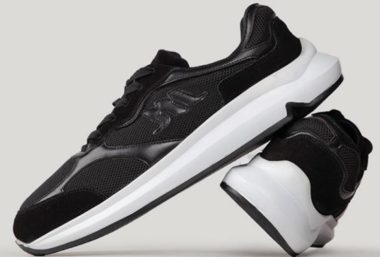
CODE : ME40350 Gender : Spaser & Natural leather