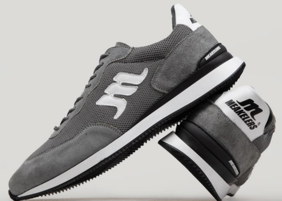
CODE : ME40250 Gender : Natural leather