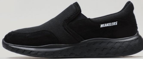
CODE : ME40009 Gender : Spaser&Natural leather