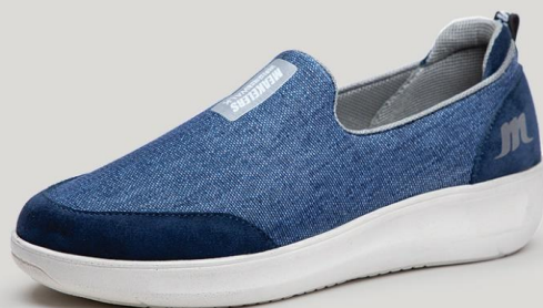
CODE : ME20431 Gender : Spaser & Natural leather