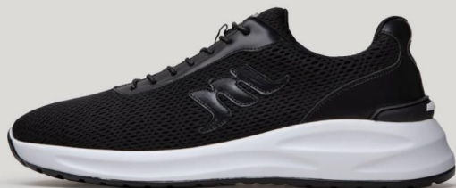
CODE : ME40300 Gender : Spaser & Natural leather