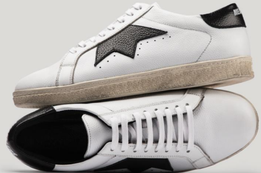
CODE : ME40200 Gender : Natural leather