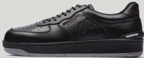
CODE : ME40102 Gender : Natural leather