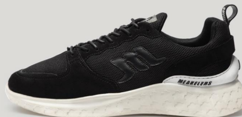
CODE : ME40006 Gender : Spaser&Natural leather