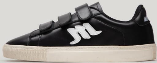
CODE : ME20165 Gender : Natural leather