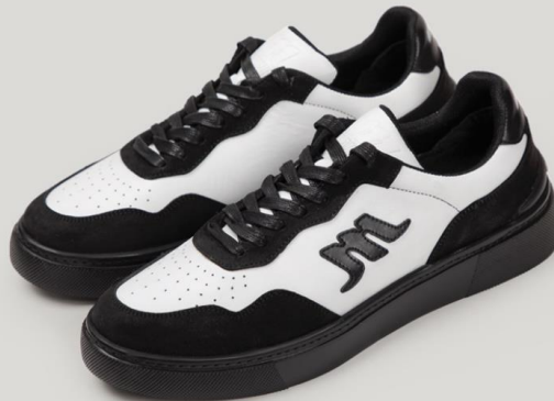
CODE : ME40330 Gender : Natural leather