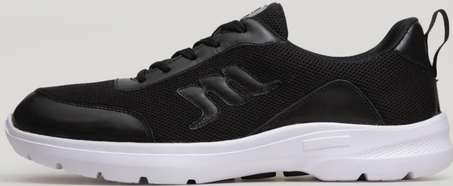
CODE : ME40400 Gender : Spaser & Natural leather