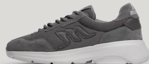
CODE : ME20440 Gender : Spaser & Natural leather