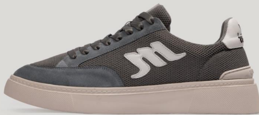
CODE : ME40334 Gender : Spaser & Natural leather