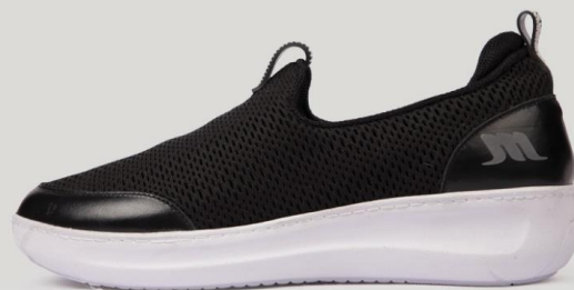
CODE : ME20430 Gender : Spaser & Natural leather