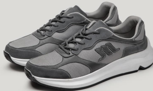
CODE : ME40350 Gender : Spaser & Natural leather