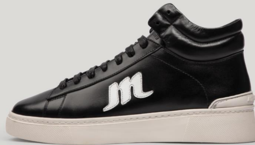
CODE : ME20134 Gender : Natural leather