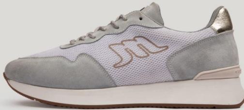
CODE : ME20151 Gender : Spaser & Natural leather