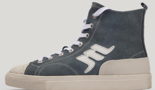
CODE : ME20162 Gender : Natural leather