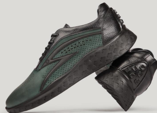
CODE : ME40002 Gender : Natural leather